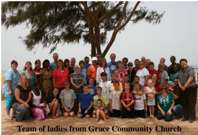
Team of ladies from Grace Community Church

A WONDERFUL team of ladies came from Grace Community Church in Tempe, AZ. They came to put on a Spiritual retreat for the 50 WorldVenture missionaries Senegal (that includes children). We worshiped, studied, prayed and ate well. The retreat was refreshing for body, soul and spirit. The retreat went great, but I think these women came just for me! Boy they ministered to me. I love to have my church family come and join me in my work and my life. They cared enough to come, and that made a big impact on me.